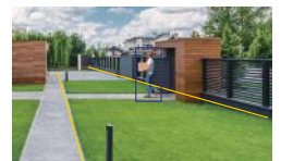
Double Line Crossing