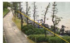
Single Line Crossing